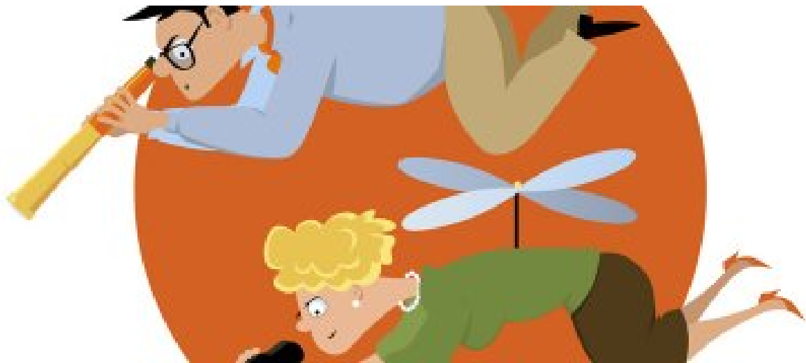
Pediatrician Q&A: Worried Sick